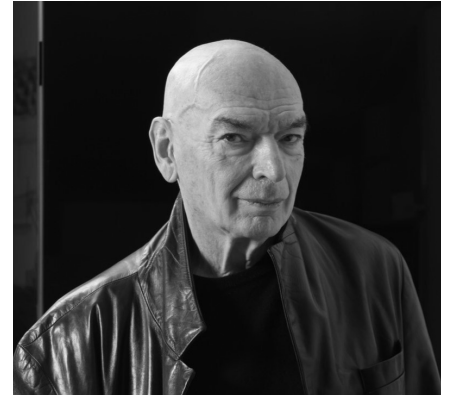
— Pritzker Prize-winning architect Jean Nouvel creates buildings and furnishings that are intimately in harmony with their surroundings — modern expressions of nature and culture.

The elementary quality I seek has nothing to do with minimalism or brutalism: it involves ambiguity and complexity. The simpler an object looks, the more obvious or familiar, the harder it is to make, the more emotion it offers, and the better it stands the test of time.”